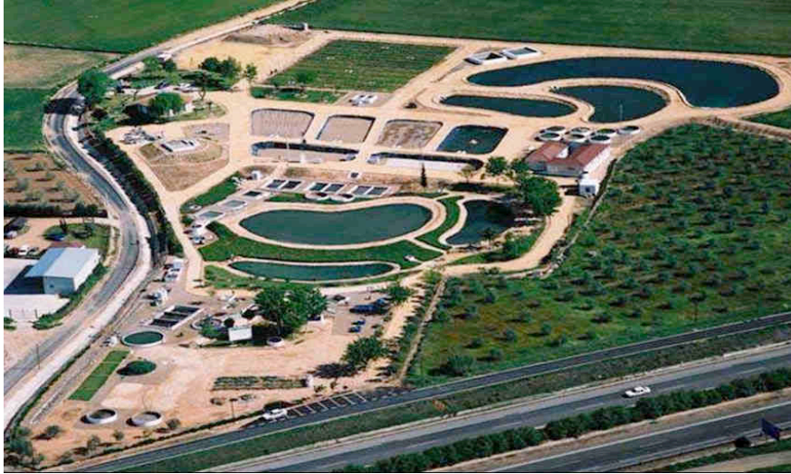
Figure 2. Overview of the Experimental Plant of Carrión de los Céspedes after the extension of 2005.

Two years later (2007), a new plot of land of 6,000 m 2 was purchased and added to the experimental facilities, thus, increasing the research extension to 41,000 m 2 . This plot has been addressed to the reuse of treated water for two different purposes: the irrigation of energy crops and the recharge of aquifers.