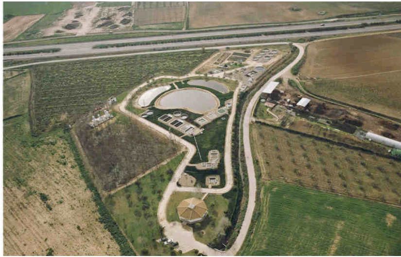
Figure 1. Overview of the Experimental Plant of Carrión de los Céspedes in its origins.

In its beginnings, the Experimental Plant of Carrión de los Céspedes (PECC) only held non-conventional technologies, nowadays properly called extensive (Green Filter-land application-, Lagooning, Peat Filters and Constructed Wetlands), spread in an extension of 21,000 m 2 (figure 1). The PECC addressed its work on the diffusion of the non-conventional systems (mainly by guide visits to the facilities) and the identification of the design criteria for the extensive technologies in order to guarantee their adaptation to the peculiar conditions of the Andalusian territory.