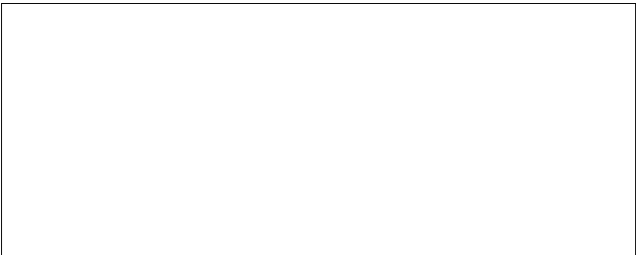
Fig 2. Distribution of acceptance/rejection of the results for detection and identification of parasitic helminth eggs attending the Z-score values and the selectivity values.

Technical competence of participants in the detection and identification of parasitic helminth eggs is high: satisfactory results in all cases exceed 50% comparing to the titled value. The Z-score value is more restrictive than the selectivity value (Fig. 2).