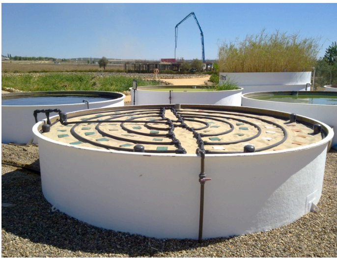
Figure 1. Intermittent sand filter

As filter material washed sand was used, the particle size shown in Figure 2.