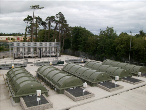
Schematic Flow Diagram of PST, RBC and FST.

5 No. RBCs with 3 No. Final Clarifiers and Slow Gravity Sandfilters in the background